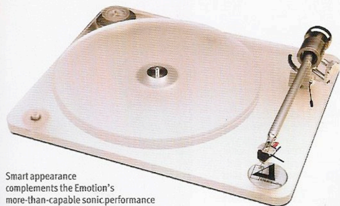
Smart appearance complements the Emotion's more-than-capable sonic performance

Clearaudio's Emotion continues to deliver a class-leading combination of excellent build and insightful sound quality