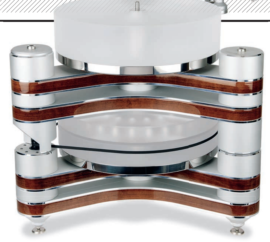
ABOVE: A complete new drive system with a single DC motor has neatly replaced the three AC motors of Clearaudio's previous 'side-force-free' belt-drive concepts