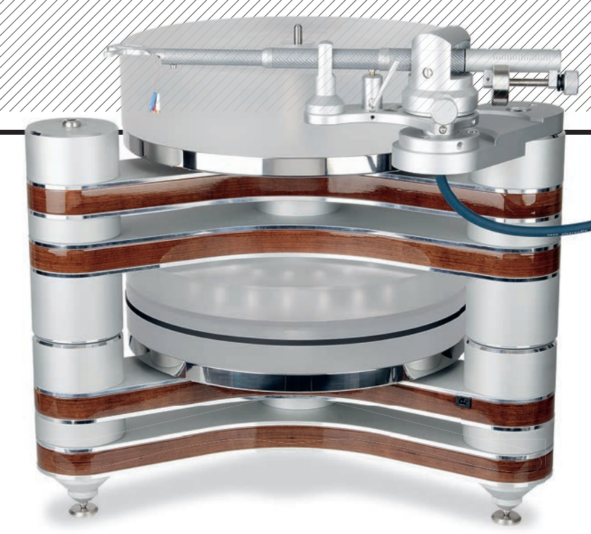
ABOVE: Since our picture was taken, Clearaudio's magnetic drive platters have had additional stainless steel elements embedded within them to increase their mass

descended into a grungy mess, but remained almost polite. On 'Watch Out For Lucy' the bass was quite agile yet somehow sounded a little elusive and perhaps not substantial enough. But again the backing details, in this case Marcy Levy's rather de-emphasised background vocals and the twitching little harmonica licks, were clear enough to catch the ear.