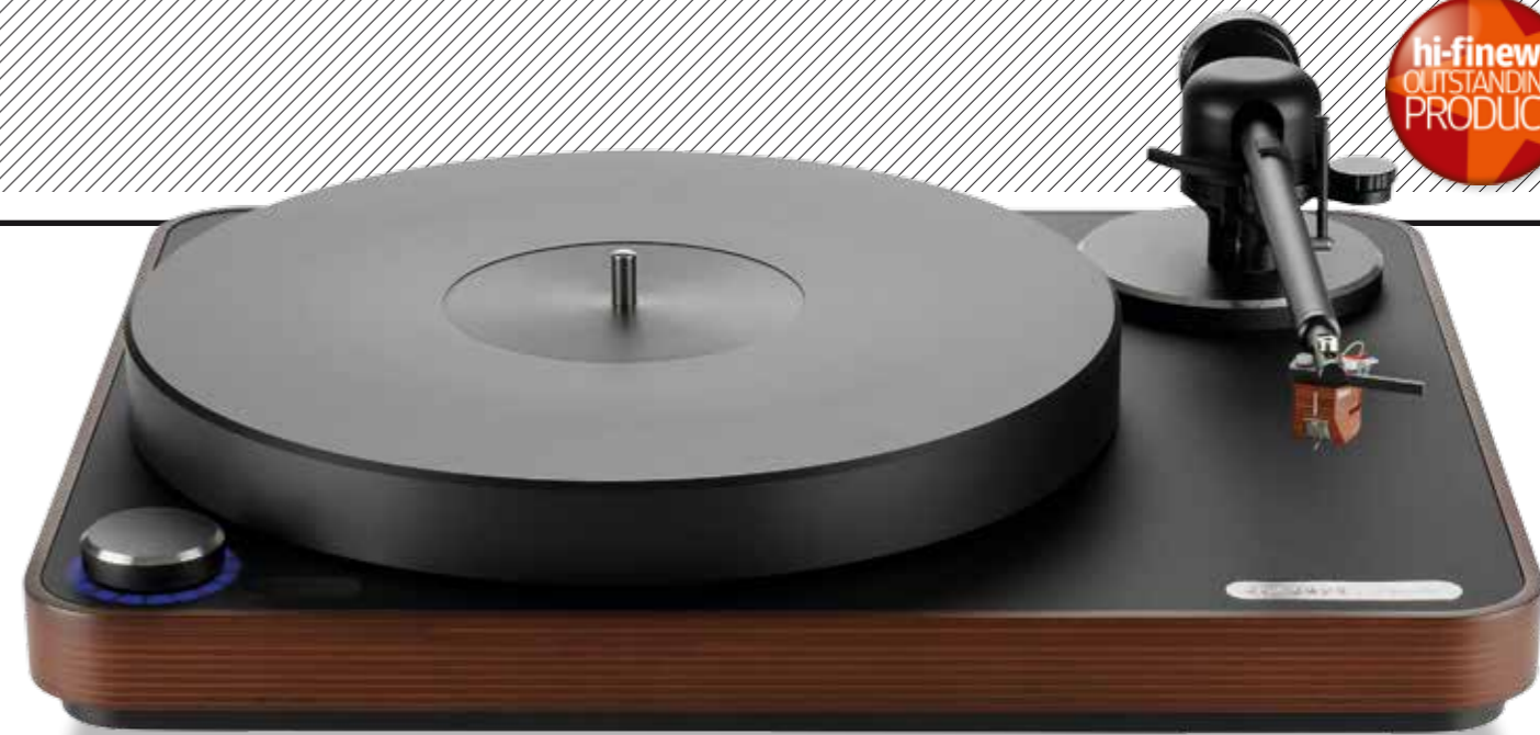
ABOVE: Shown in its premium dark wood plinth, the Concept Signature is also offered in black and white colourways. The Profilur arm is seen here with the mid-range Jubilee MM

Clearaudio's Profilur tonearm (£1900 when bought on its own) is a relatively recent addition to the brand's stable. Described as an ideal link between the Satisfy Kardan and Tracer models, the arm is available in both black and silver finishes, and combines a horizontal sapphire bearing with a vertical ball bearing in an 'anti-resonance' housing. Aluminium alloy is used for the main armtube, damped at selected points along its length. The headshell is a basic support platform that bolts onto a slotted mount on the end of the arm – this mount may be rotated for optimum azimuth setup after loosening a screw under the armtube.