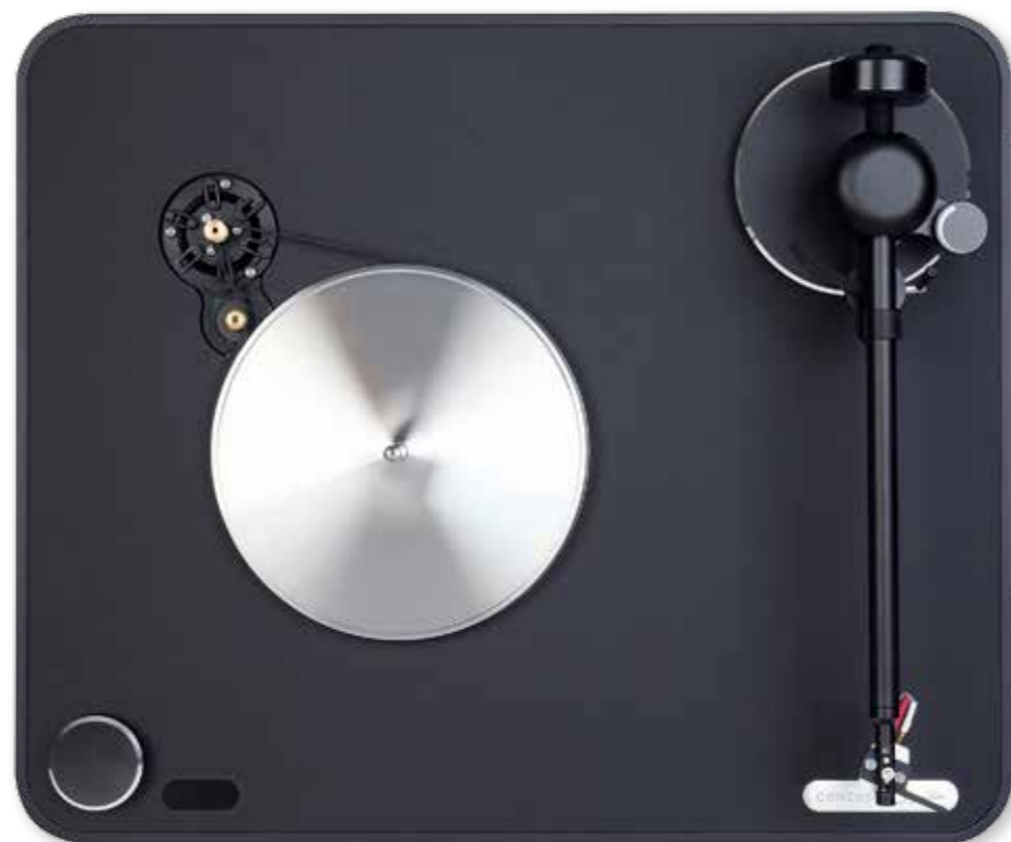
RIGHT: CNC-machined alloy sub-platter is driven via a flat belt from a DC motor that's suspended via a series of O-rings. The belt is threaded around a second pulley that's part of the 'Tacho Speed Control' (speed monitoring)

'Double bass was warm, woody and atmospheric'