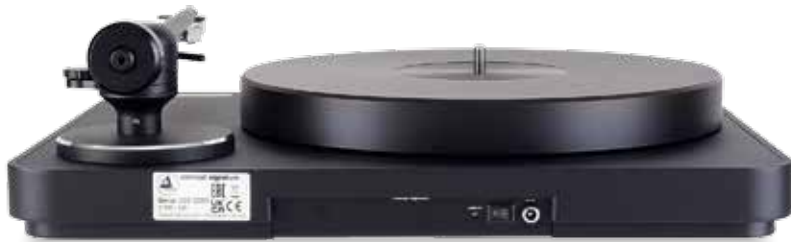
ABOVE: The Profiler tonearm's counterweight is a tight fit but still decoupled from the tube's rear stub. Socket for the external wall-wart PSU is located near the on/off switch and recessed calibration mode button. Three feet [underneath] are adjustable

Firmly in the latter camp is Kari Bremnes' 'A Lover In Berlin', taken from her Norwegian Mood album [Kirkelig Kulturverksted ARS FXPL 221], where her vocals appeared to float between and slightly in front of my speakers. The level of emotion that this Clearaudio combo pulled from this seductively simple recording was a joy to behold.