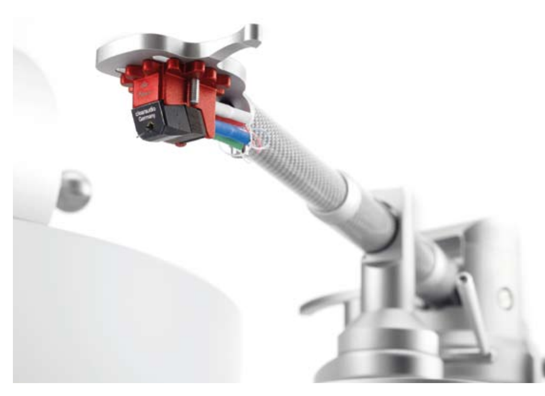
Da Vinci Red: within its aluminium casing covered in a red ceramic coating the moving coil system houses lightweight, fine gold coils, plus eight magnets for a high degree of effectiveness and perfect symmetry.

The clumsy handling with the evolutionarily developed linear tracking in Clearaudio style when changing records is thus in stark contrast to the delicate endeavours when positioning and lowering the needle. And it should definitely not be handled too firmly, as it is, after all, a pricey Da Vinci 2V - an MC cartridge system with a mechanically, magnetically and electrically wholly symmetric design. In order to quickly dissipate any resonance the body, made of aluminium alloy, has been covered with a very hard cera-