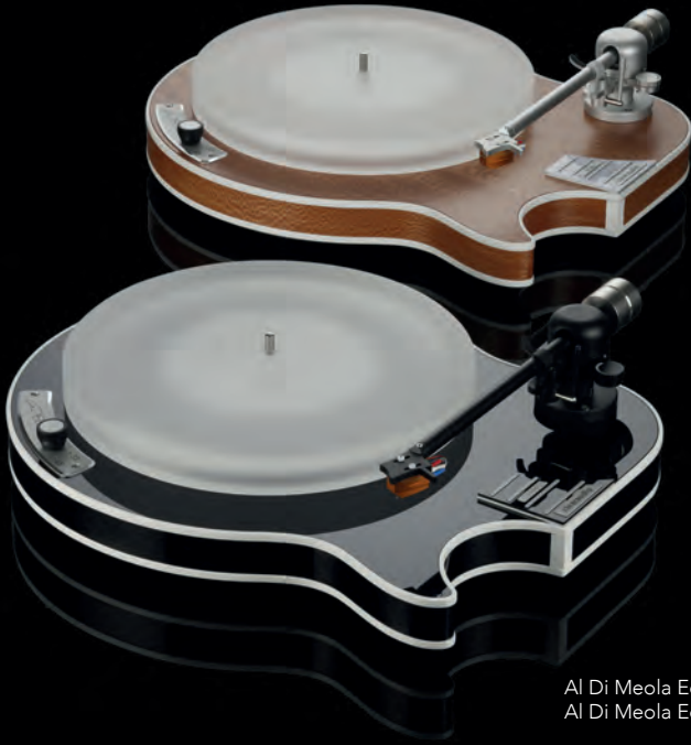
Al Di Meola Edition, wood Al Di Meola Edition, black