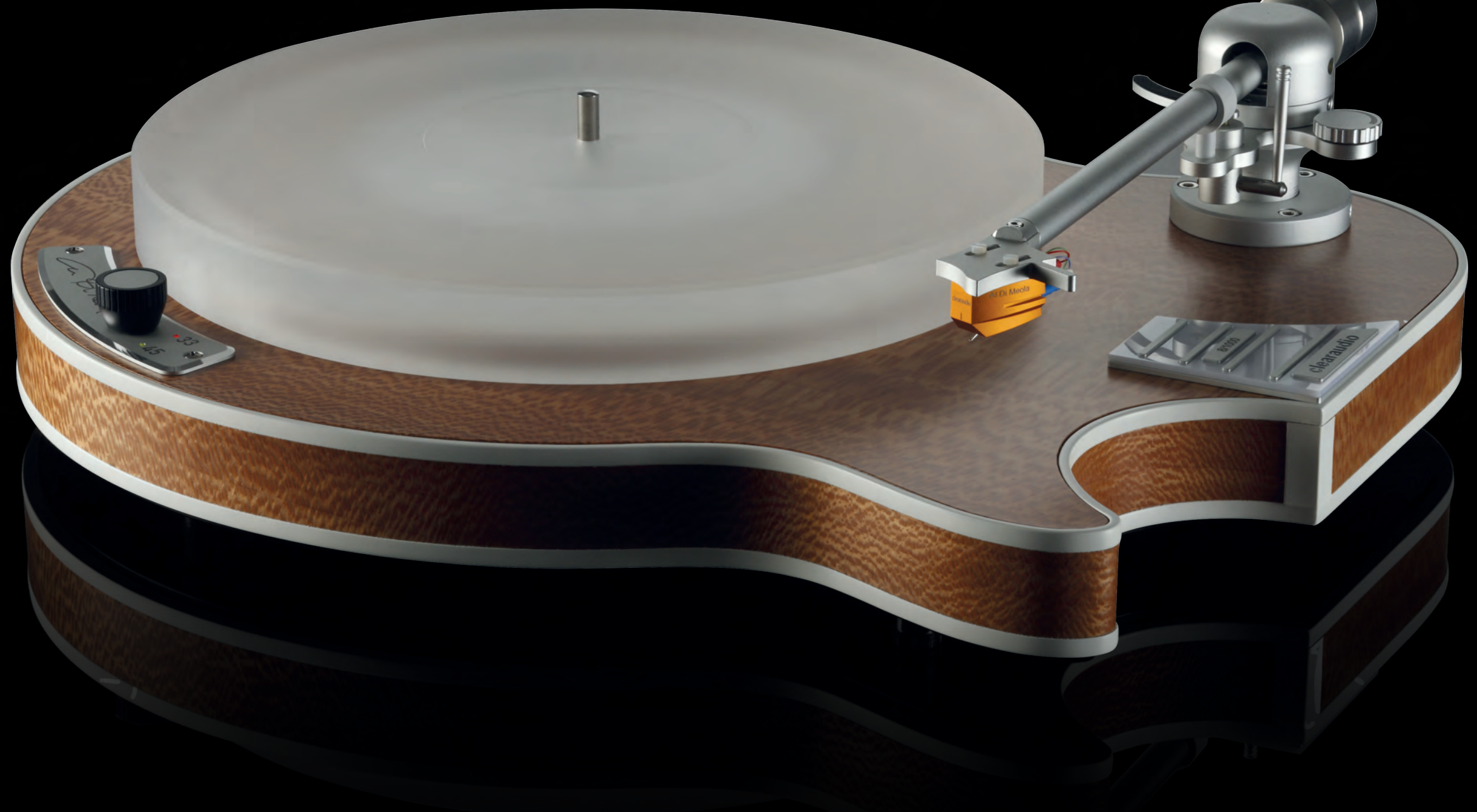
Turntable: Al Di Meola Edition, wood