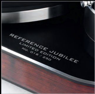
Limited Edition - Only 250 units