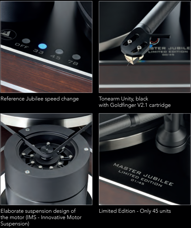
Reference Jubilee speed change