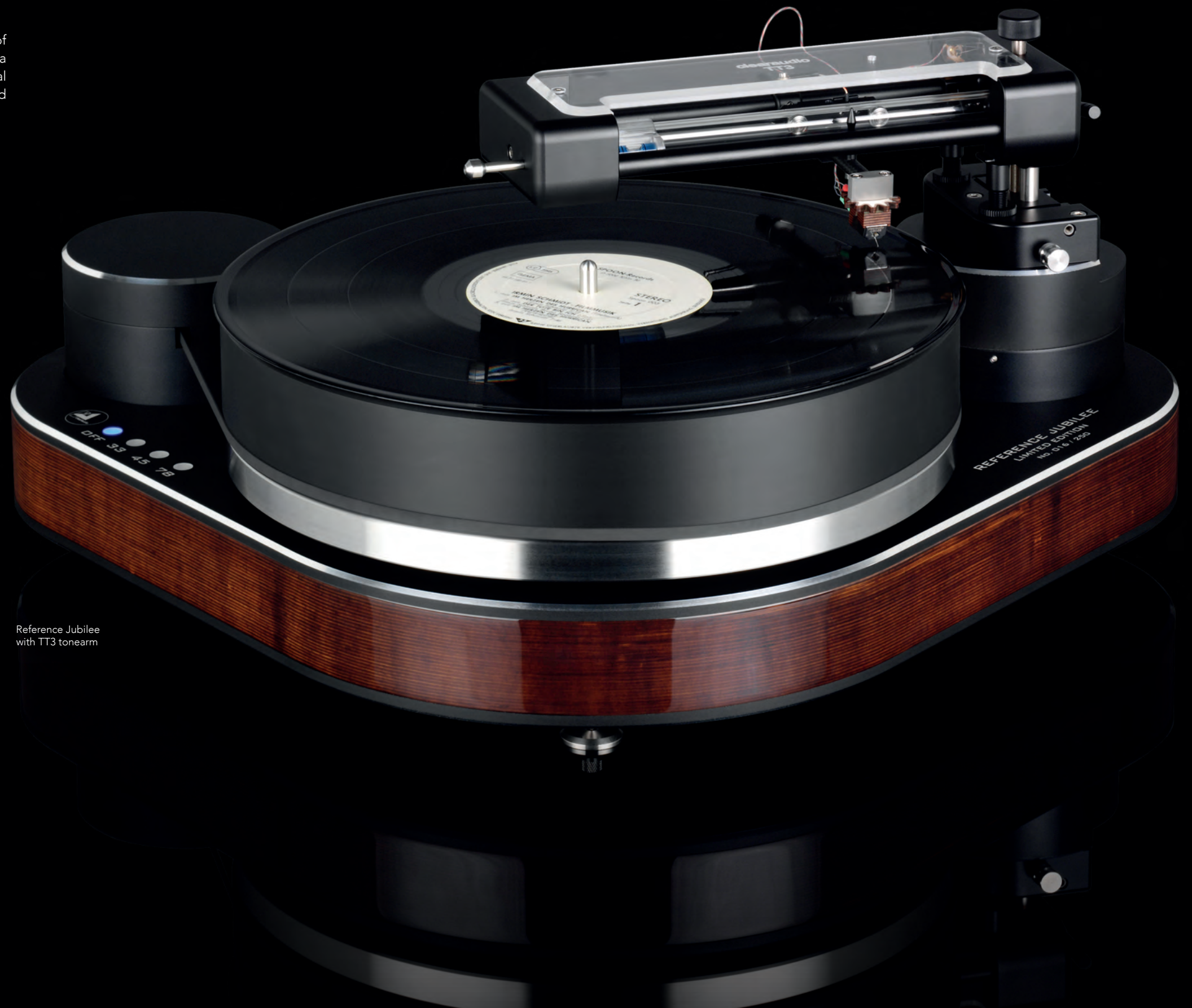
Reference Jubilee with TT3 tonearm

The new Reference Jubilee turntable marries the best of Clearaudio's 40 years of excellence to usher in a new era of analogue precision. It delivers synchronized rotational speed, astonishingly low levels of both resonance and friction, and a breathtaking moment of torque.