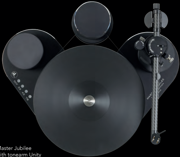
Master Jubilee with tonearm Unify