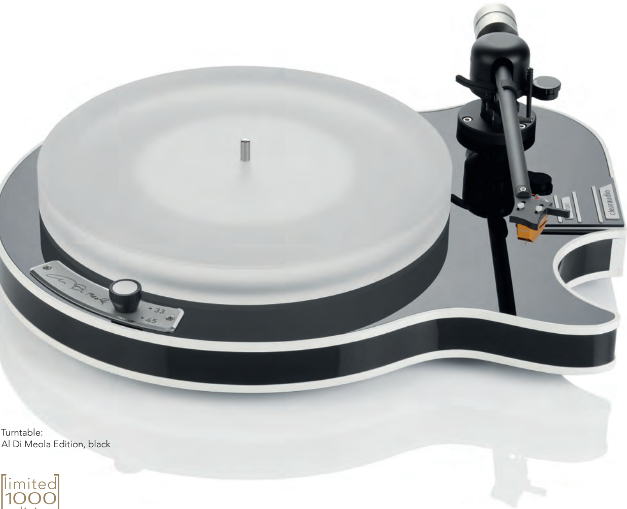
Turntable: Al Di Meola Edition, black

The unique design of the Celebrity turntable combines functionality with aesthetics. The volume control knob, resembling an electric guitar's knob, serves as a multifunctional dial with touch functionality. With a simple press, you can start the turntable, switch between speeds (33 1/3 and 45 RPM) and put it into standby mode. The outer appearance of the Celebrity turntable is completed by a special version of the Profiler tonearm and a new MM cartridge, also named Celebrity. The Celebrity turntable is available exclusively in black or wood design . Overall, this package is limited to 1,000 units and includes a specially numbered collector's edition vinyl album by the artist and a guitar plectrum. A true work of art, created by Al Di Meola, Impex Records, and Clearaudio.