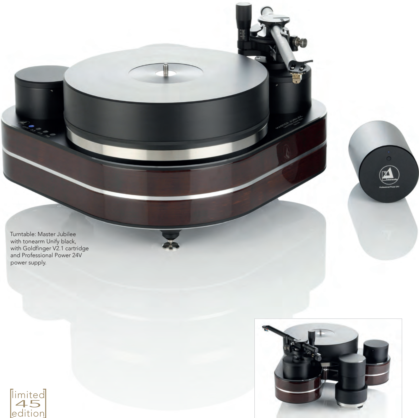
Turntable: Master Jubilee with tonearm Unify black, with Goldfinger V2.1 cartridge and Professional Power 24V power supply.

The results of the wow and flutter measurements are likely unmatched by any other turntable manufacturer. The Professional Power 24V power supply is also included with the Master Jubilee.