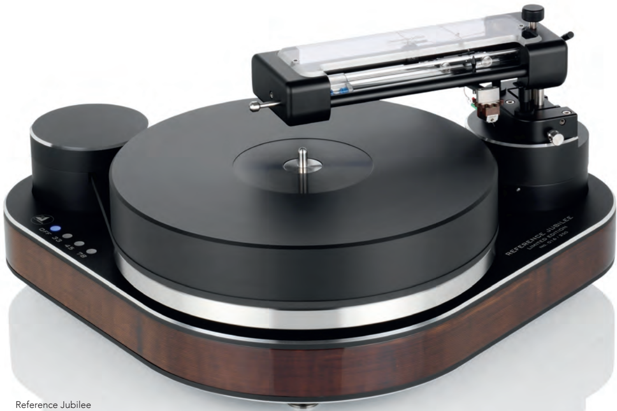
Reference Jubilee with TT3 tonearm

Every three seconds, an optical sensor takes a reading of the 8.5kg stainless steel sub-platter's rotational speed, and delivers that reading to a control unit. The control unit then immediately regulates the slightest deviations by adjusting the motor's voltage via an operational amplifier. The Reference Jubilee's brand new air-core (non-magnetic) 24-volt DC motor runs unbelievably quietly, ensuring that the listener remains blissfully unaware of the whole process. The Professional Power 24V linear power supply is already included.