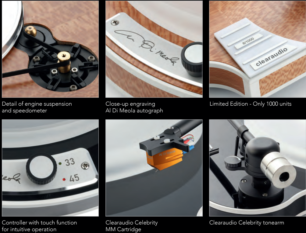
Detail of engine suspension and speedometer