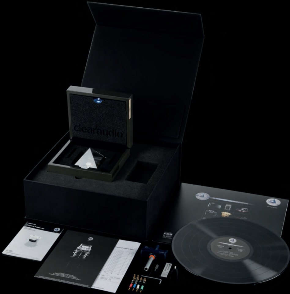
Diamond Jubilee, scope of delivery