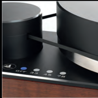
Reference Jubilee speed change