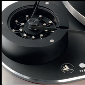
Elaborate suspension design of the motor (IMS - Innovative Motor Suspension)