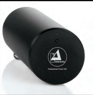
Professional Power 24V