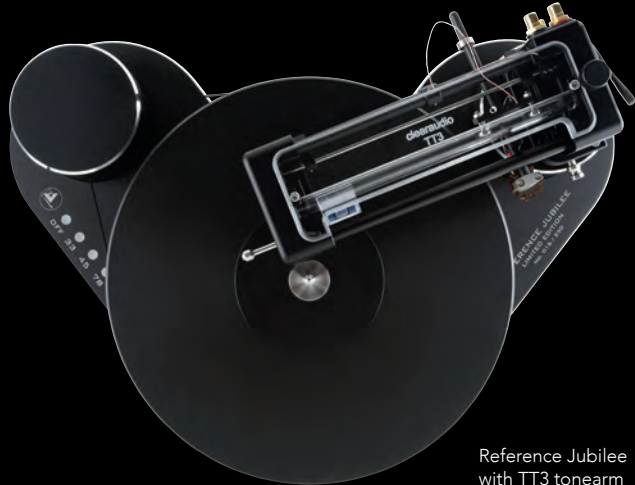
Reference Jubilee with TT3 tonearm