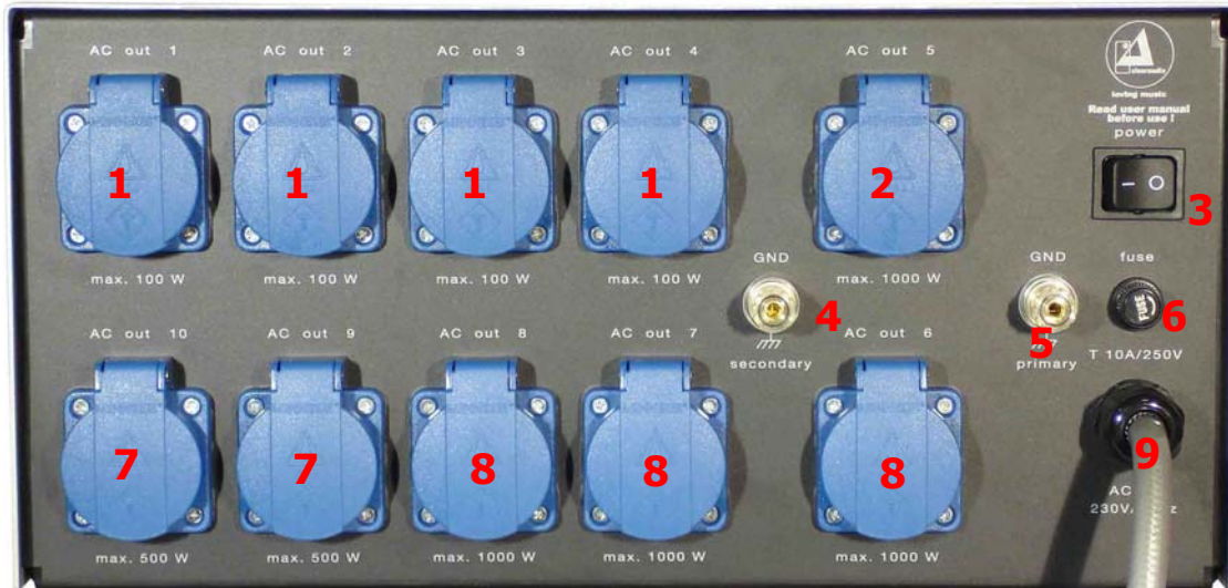
Pic. 2: Rear view and operation elements